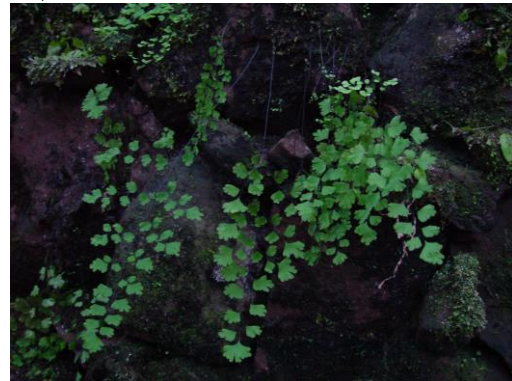
Plants have also colonised damp walls at The Firs Experimental Station (SJ8594).

Status & distribution: Naturalised in South Lancashire; A single plant was discovered at Bridge 96, Sackville Street/Canal Street, Manchester (SJ8497, AR Locksley, 2001, voucher specimen DP Earl, MANCH) and numerous plants are now well established here and at Bridge 95, Chorlton Street/Canal Street.