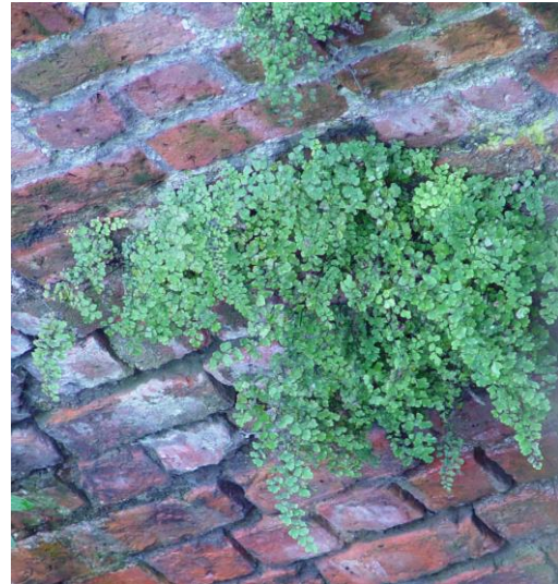
Canal Street, Manchester DP Earl 2020

Status & distribution: Naturalised in South Lancashire; A single plant was discovered at Bridge 96, Sackville Street/Canal Street, Manchester (SJ8497, AR Locksley, 2001, voucher specimen DP Earl, MANCH) and numerous plants are now well established here and at Bridge 95, Chorlton Street/Canal Street.