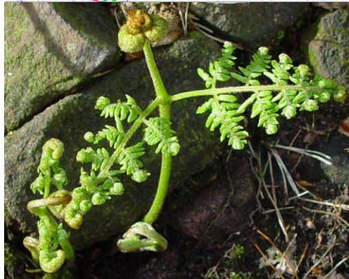
Harrock Hill DP Earl 2008

Status & distribution: Native, Least Concern (Red List for England); widespread and often locally dominant in the hill districts and on the former mosslands.