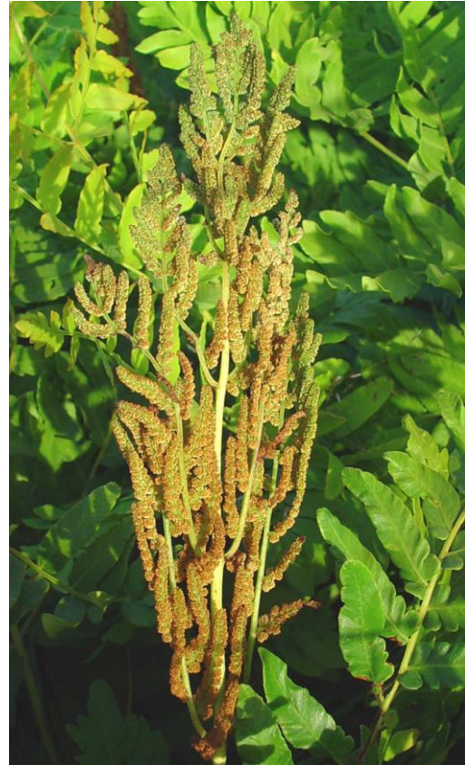
Freshfield Heath DP Earl 2008