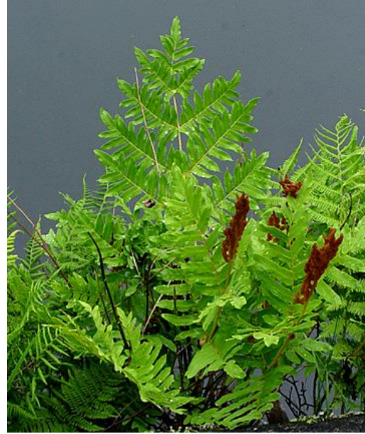
Manchester, Bolton & Bury Canal

altitude of 419m on Holcombe Moor.