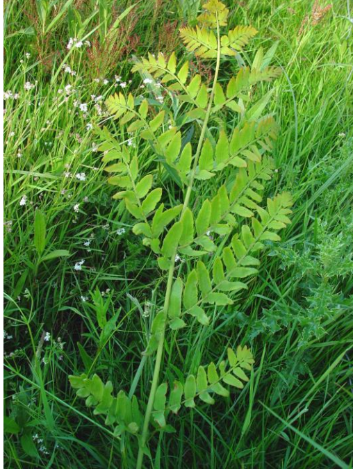
Mere Sands DP Earl 2008

Status & distribution: Native, Least Concern (Red List for England); Axiophyte; widespread in the lowlands; very local in the upland districts.