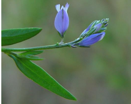
Ainsdale DP Earl 2008

Status & distribution: Native, Least Concern (Red List for England); Axiophyte. Locally abundant along the coastal fringe and frequent in the north-eastern hill districts.