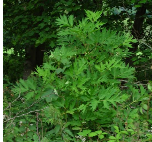
Whittle-le-Woods DP Earl 2020

Status & distribution: Neophyte-naturalised; seven saplings or suckers found at Fazakerley Sidings (SJ3897, DP Earl & PS Gateley, LBS Exc., 2013); at least two plants on wooded edge of the grounds of Lisieux Hall, Whittle-le-Woods (DP & J Earl, 2020).