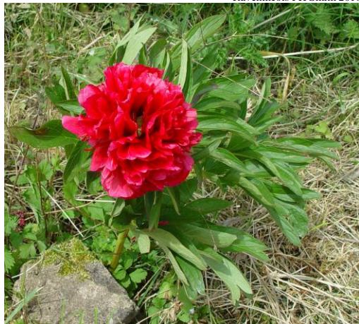
Higher Walton DP Earl 2020

Status & distribution: Neophyte-naturalised-surviving, widespread but somewhat localised.