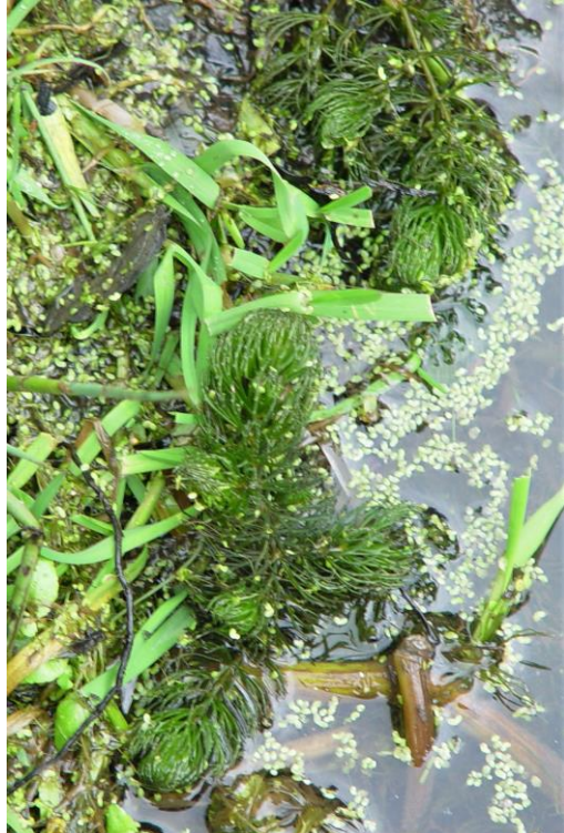
Pond at Withy Tress Park DP Earl 2020

Status & distribution: Native, Least Concern (Red List for England); SCINWE, Axiophyte, widespread and locally frequent at lower altitudes, locally abundant along some canal stretches such as the Leeds & Liverpool Canal from the Rimrose Valley to Lydiate.