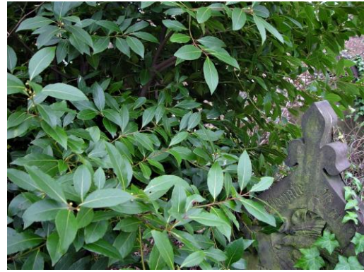
Pendlebury DP Earl 2023

Status & distribution: Neophyte-naturalised; widely planted and sometimes regenerating.