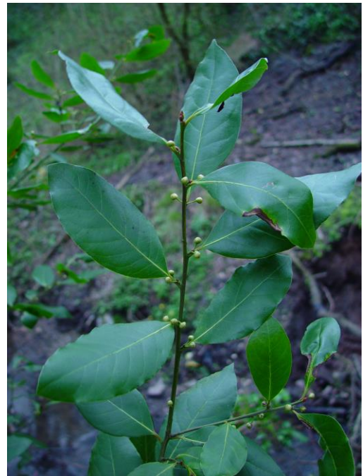
Dog Kennel Wood, Walton-le-Dale

Comments: Native to the Mediterranean where a feature of the Maquis shrub communities.