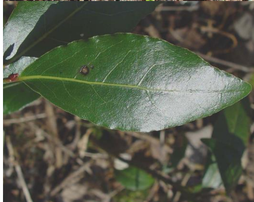
Saplings at Walkden DP Earl 2009