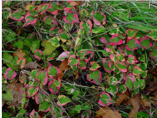
Boothstown DP Earl 2012

Status & distribution: Neophyte-surviving; the typical form is established along a path side at Bamber Bridge (SD5526, DP Earl, 2011). Most records are of 'Variegata' (also known as 'Chamaeleon') with records from Ruff Lane (SD4107, MP Wilcox, 2004); Cable Street, Formby (SD3007, PH Smith & MP Wilcox, 2006); along a passage at Ashton-in-Makerfield (SJ5899, DP Earl, 2009); Euxton (SD5619, DP & J Earl, 2011); Boothstown (SD7101, DP & J Earl, 2012), this variety is of horticultural origin.