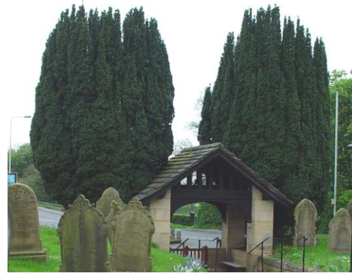
Irish Yew - Halsall Church DP Earl 2008