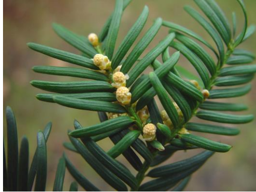
Croxtheth DP Earl 2009

Status & distribution: Neophyte-naturalised; widespread, locally frequent in wooded districts and frequently self-sown.