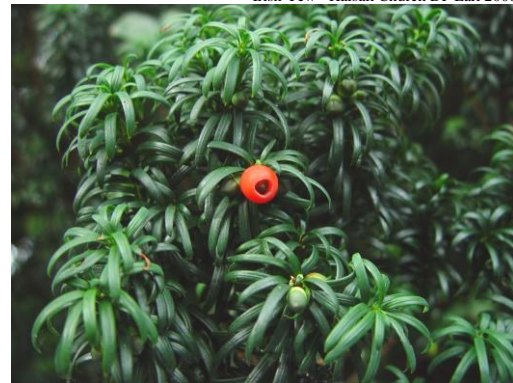
Irish Yew - Charnock Richard Church