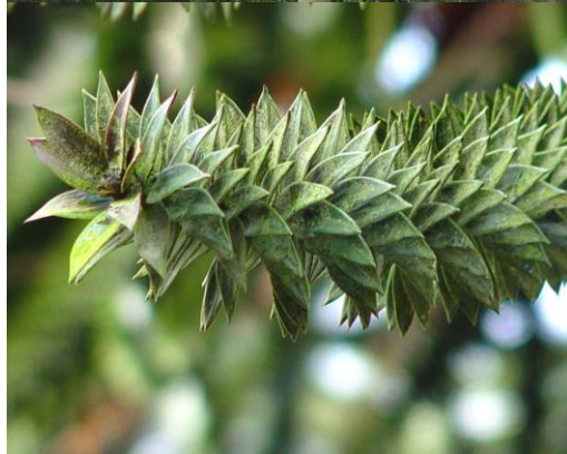
Billinge Hill, Blackburn DP Earl 2009