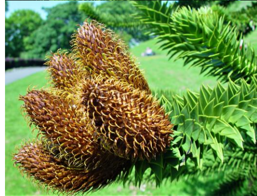
Clitheroe DP Earl 2021