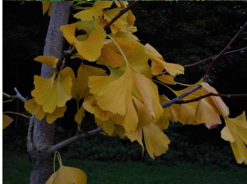
Worden Park DP Earl 2020

Status & distribution: Neophyte-surviving, widely planted.