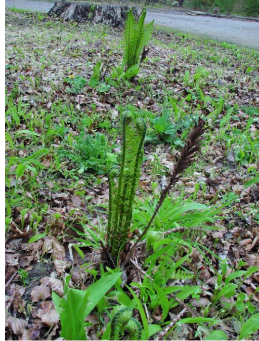
Whalley Abbey DP Earl 2021