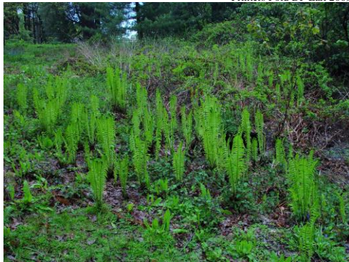
Cuerden Country Park DP Earl 2021

Status & distribution: Neophyte-naturalised; scattered but increasingly established across the vice-county usually as isolated clumps.