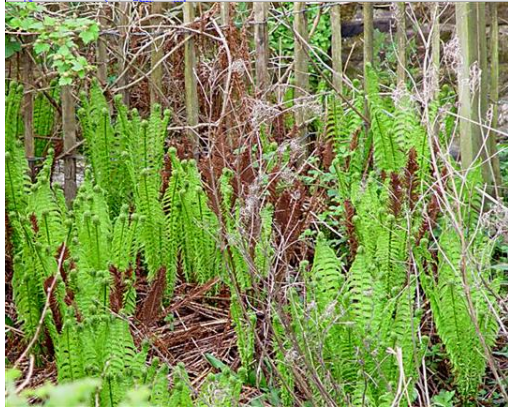
Printers Fold DP Earl 2009