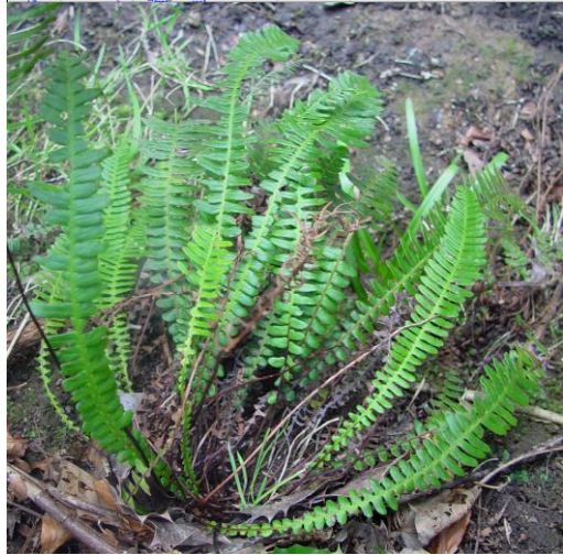
Daisy Hill, Westthoughton DP Earl 2020

Status & distribution: Native, Least Concern (Red List for England); a common species in the hill districts, less frequent at lower altitudes and absent from the lowland clay districts to the west of Preston.