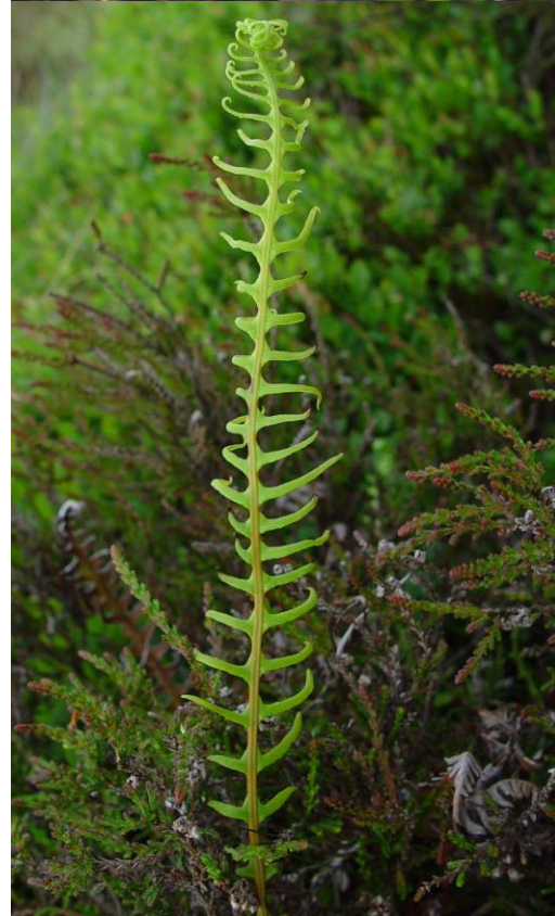
Wycoller DP Earl 2008