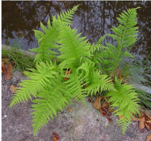
Rufford DP Earl 2020

Status & distribution: Native, Least Concern (Red List for England); generally common especially in the hill districts and the east; less frequent at lower altitudes in the western regions; uncommon in the arable and reclaimed marshland districts.