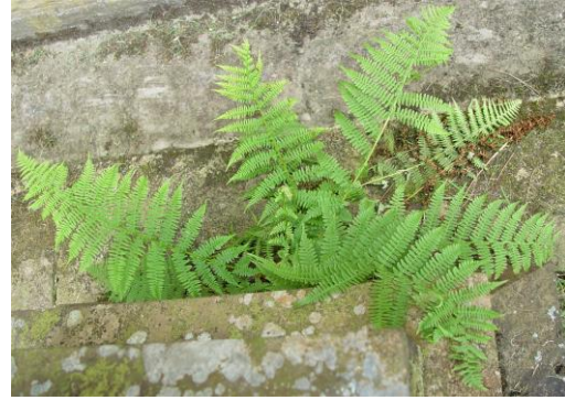
Bamber Bridge DP Earl 2021

Habitat: Stream banks, canal sides, cloughs, woodlands, moorland flushes, damp walls and residential gardens.