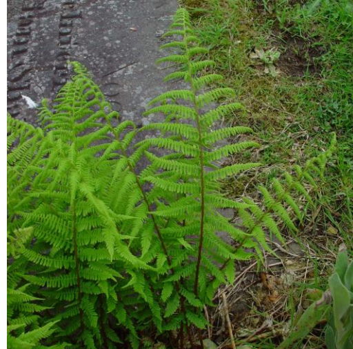
Halsall DP Earl 2008