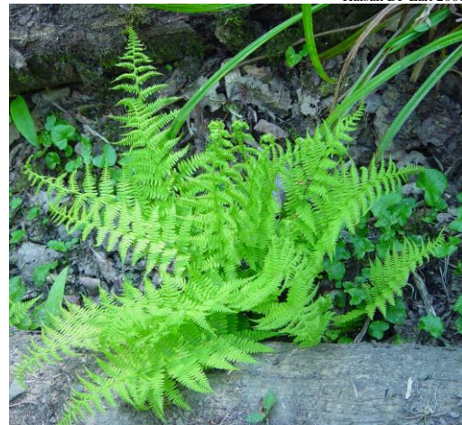
Dog Kennel Wood DP Earl 2020