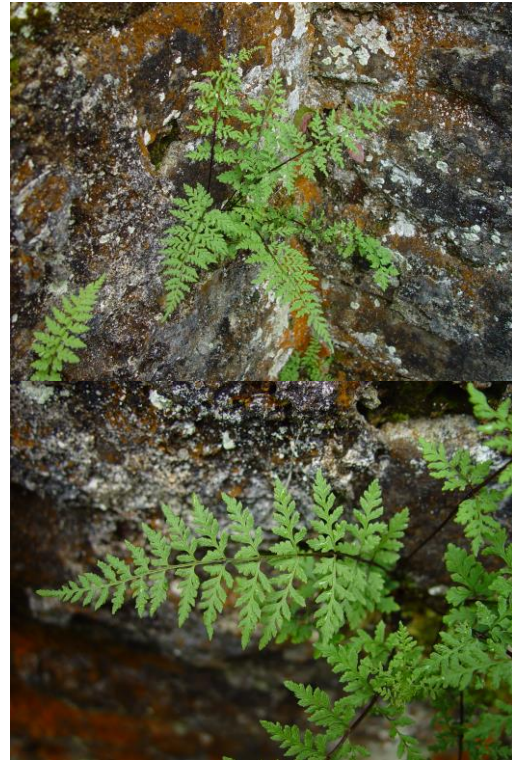
Wycoller DP Earl 2008