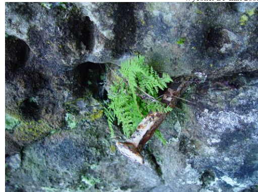
Foulridge Tunnel DP Earl 2019

Status & distribution: Native, Least Concern (Red List for England); Axiophyte; this species is occasional to locally frequent in the north-east of the vice-county.