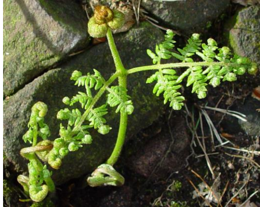
Harrock Hill DP Earl 2008