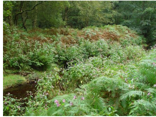
Brinscall DP Earl 2020