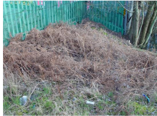
Bamber Bridge DP Earl 2020

Status & distribution: Native, Least Concern (Red List for England); widespread and often locally dominant in the hill districts and on the former mosslands.