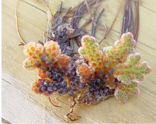
Hesketh, Southport DP Earl 2008