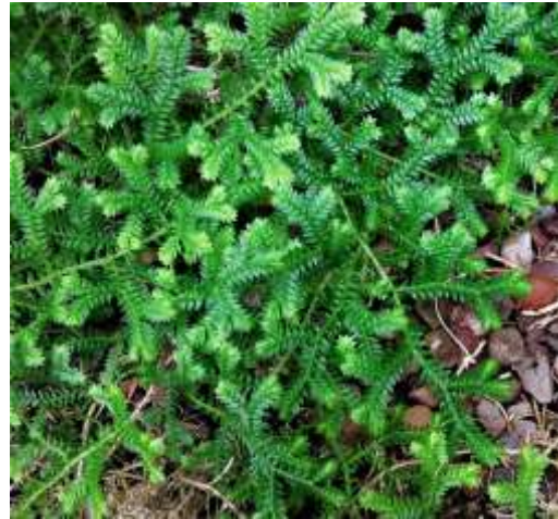
The Firs