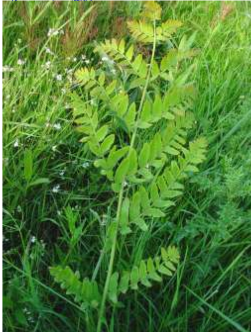
Mere Sands DP Earl 2008

Status & distribution: Native, Least Concern (Red List for England); Axiohyte, widespread in the lowlands; very local in the upland districts.