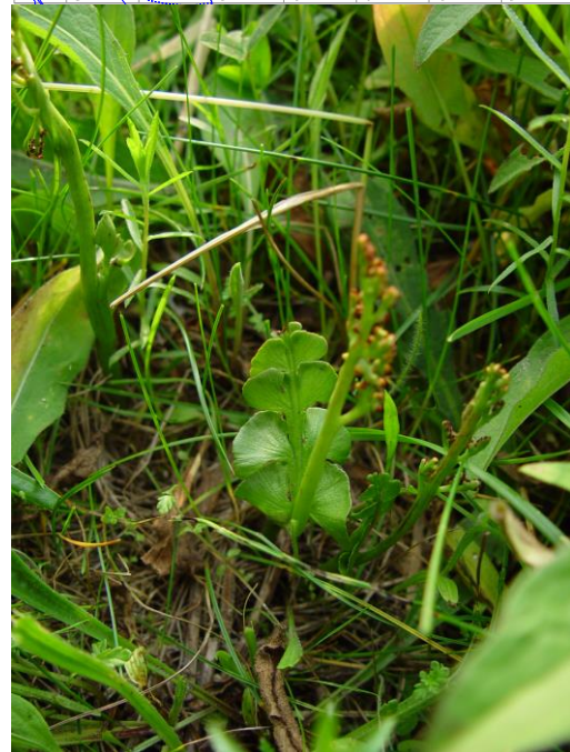
Belmont DP Earl 2015

Status & distribution: Native, Vulnerable (Red List England); Endangered (2) at the vice-county level at a moorland roadside verge above Belmont, Lancashire (SD61U, P Jepson, 2015); grassland bank at Holcombe Moor, Greater Manchester (SD7616, DP Earl, 2019).