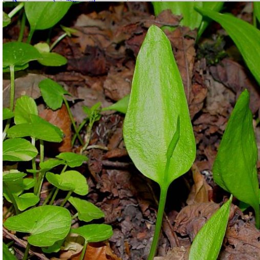
Bretherton DP Earl 2008

Status & distribution: Native, Axiophyte, declining. Widespread but occasional although locally frequent in some hill districts; formerly considered common.